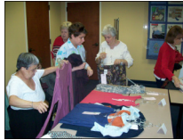
(Browsing through the clothing)